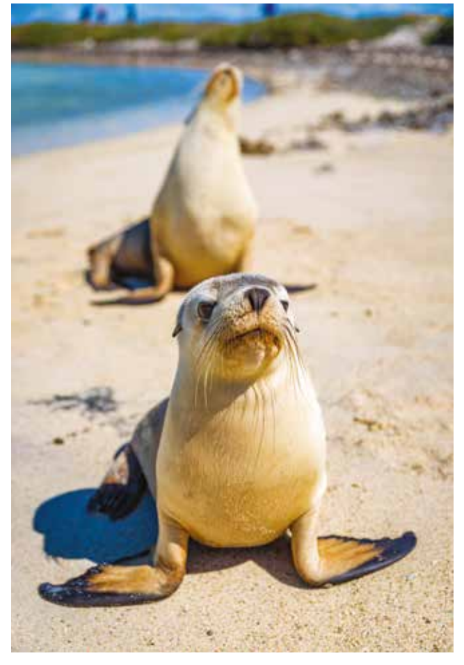
Clockwise from top: The water surrounding the low lying coral islands is crystal clear and full of life; The wonderfully curious sea lions that inhabit the island group investigate the human visitors without fear; Even on coral islands with no soil, West Australian wildflowers take hold and thrive.